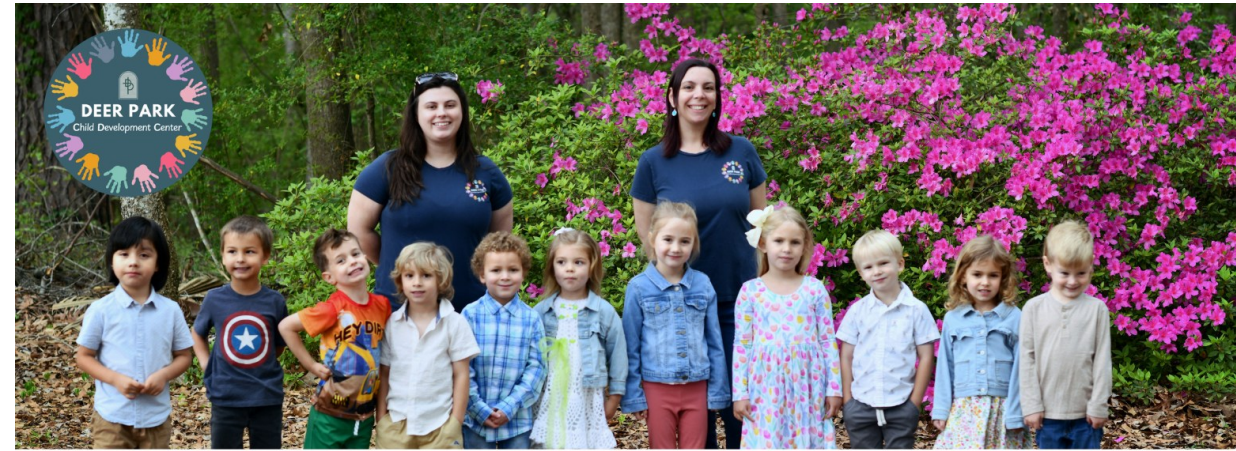
The 4's ~ Graduating Class of 2026