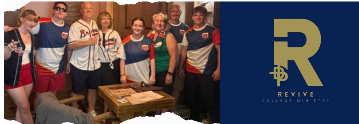
REVIVE Students & Parents/Siblings at June's Braves Game