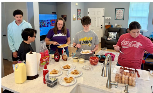
Upper Room Brunch for June

We look forward to spending another great month together and hope to see you at these events!