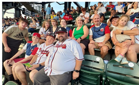
Braves Trip ~ June